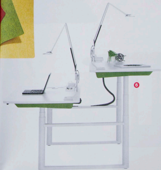
6 VITRA TYDE SIT-STAND TABLES The Tyde series allows you to sit or stand at double workstations or conference tables. A nifty electric height-adjustment motor is especially quiet and is hidden under the table, inside a sound-absorbing cover. vitra.com