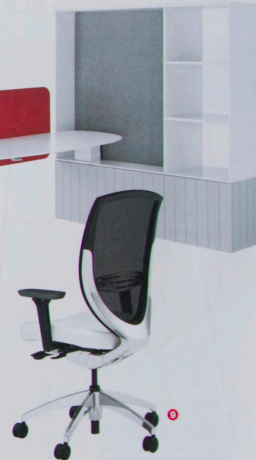
9 KIMBALLOFFICE WISH CHAIR These option-rich seats promise everything you wish for in any kind of work space, with variations available for arms, lumbar support, seat sliders, bases, wishbones, uprights, and controls. Designers can also choose from nine colors for the mesh back and seat. kimballoffice.com