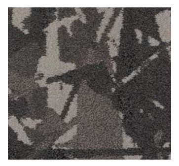
Best Seller 800105