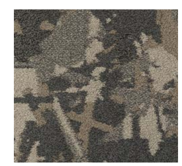
Wait List 800111