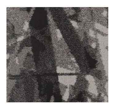
First Edition 800100

DOG EARED and DUST JACKET color line as featured in architect folder.