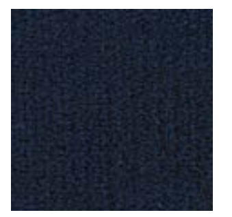
Thunder + Lightning 400345