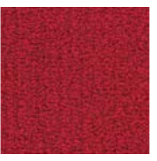
Yin + Yang 400354