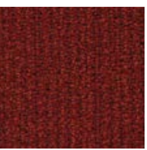
Lock + Key 400351