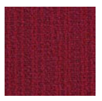
Fun + Games 400353