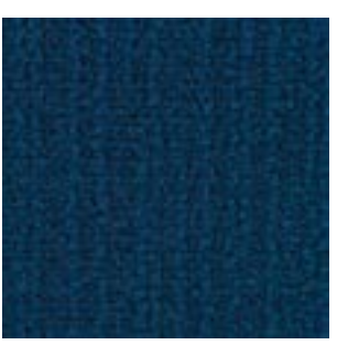
Supply + Demand 400350