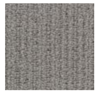
Nickel + Dime 400359