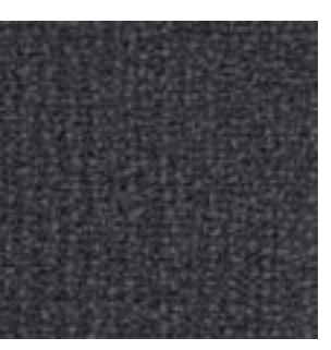
Nuts + Bolts 400362