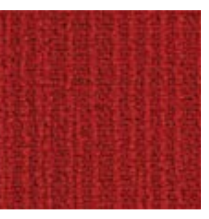
Dog + Pony 400352