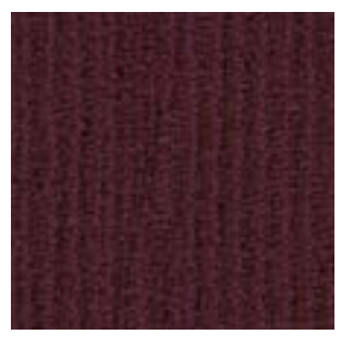
Wine + Cheese 400356