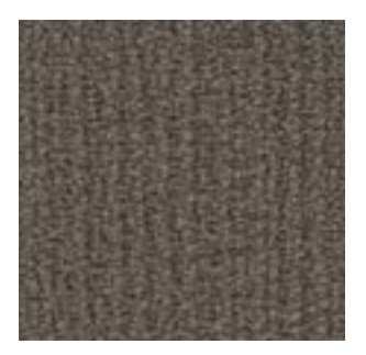
Track + Field 400361