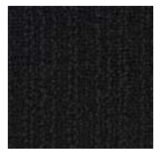
Night + Day 400357