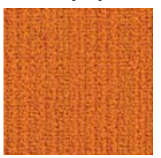
Lost + Found 400349