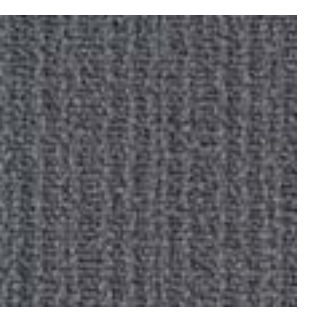
Pen + Pencil 400358