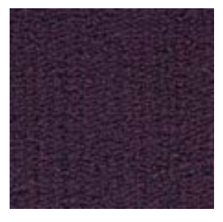
King + Queen 400355