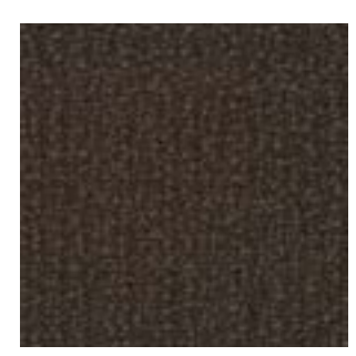
Brick + Mortar 400363