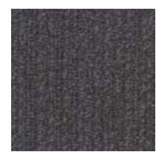
Salt + Pepper 400360

The printed images may not be an accurate reproduction of the product's actual colorways. We strive to offer an authentic representation, but images may vary according to press run. These images are intended as a guide only. If you would like a sample of this product, please call Customer Care at 800.423.4709 .