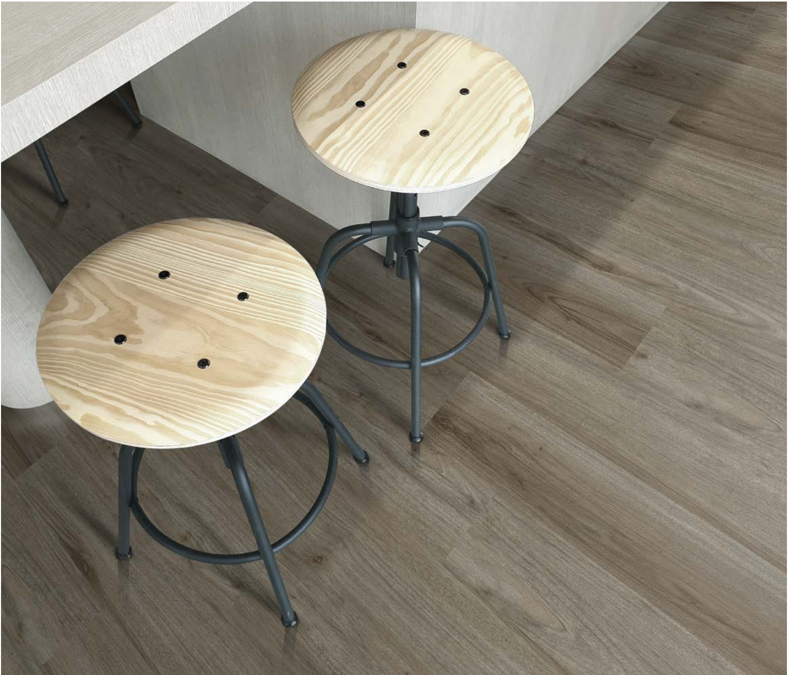
GROUND RULES BGRRUL, COME PREPARED 802013, 6 IN X 48 IN - RANDOM ASHLAR

Installation: All Bentley Luxury Vinyl Tile products must be installed by flooring installers who are professionally trained and experienced in current techniques and industry accepted standards for professional installation of luxury vinyl tile flooring. Please refer to the current issue of Bentley's Luxury Vinyl Tile (LVT) Installation Guidelines.