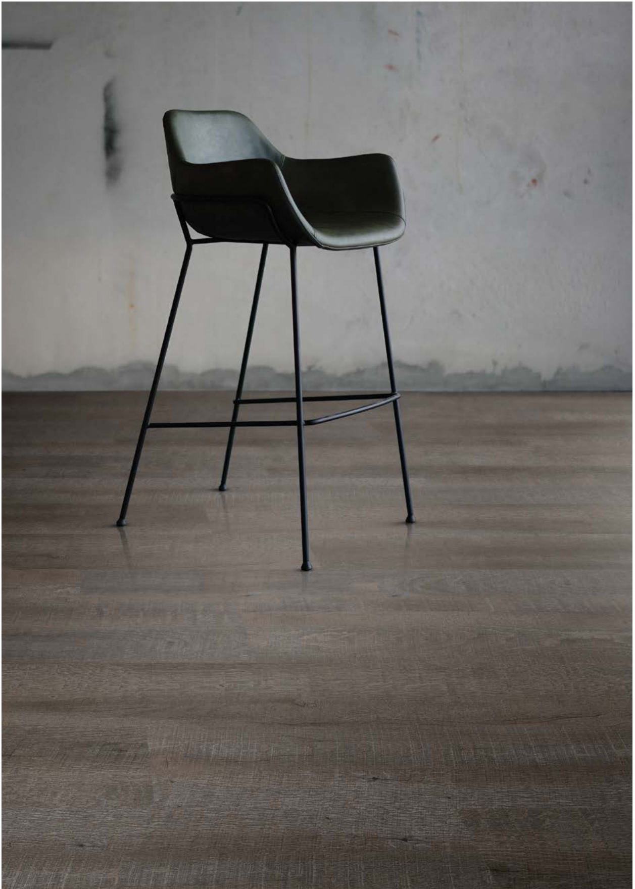
GROUND RULES BGRRUL, BE ON TIME 802017, 6 IN X 48 IN - RANDOM ASHLAR