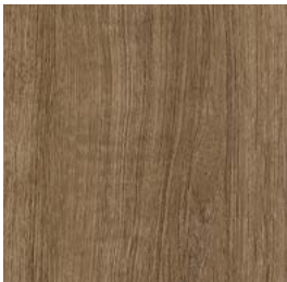
Wait Your Turn 802015