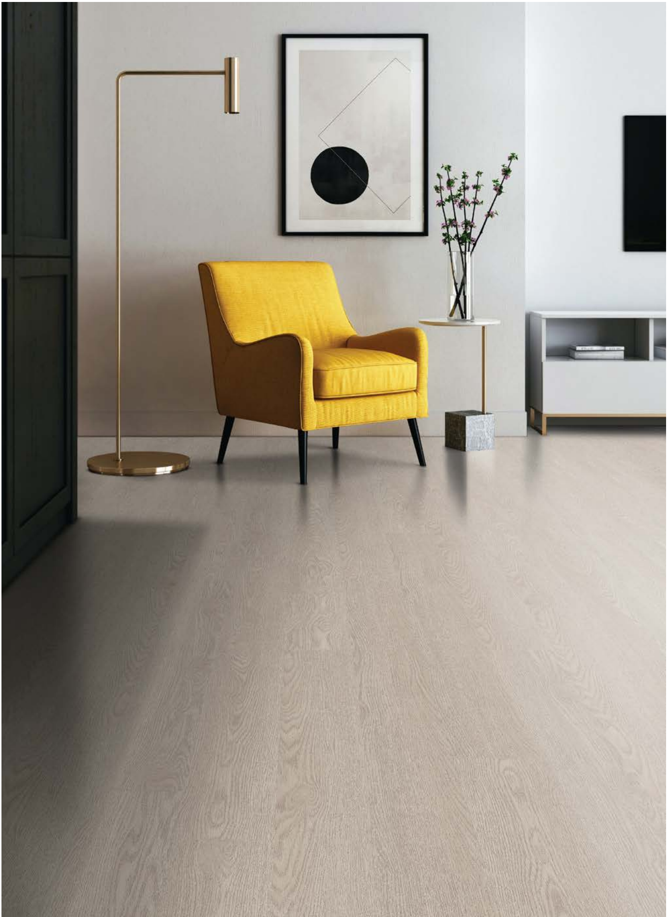
GROUND RULES BGRRUL, FRESH START 802010, 6 IN X 48 IN - RANDOM ASHLAR