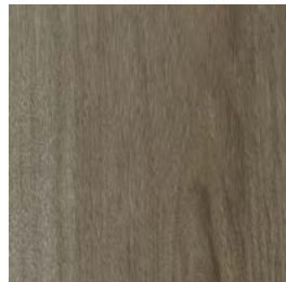
First In Line 802018