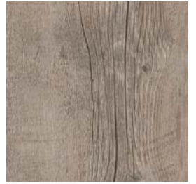
Wash Your Hands 802014