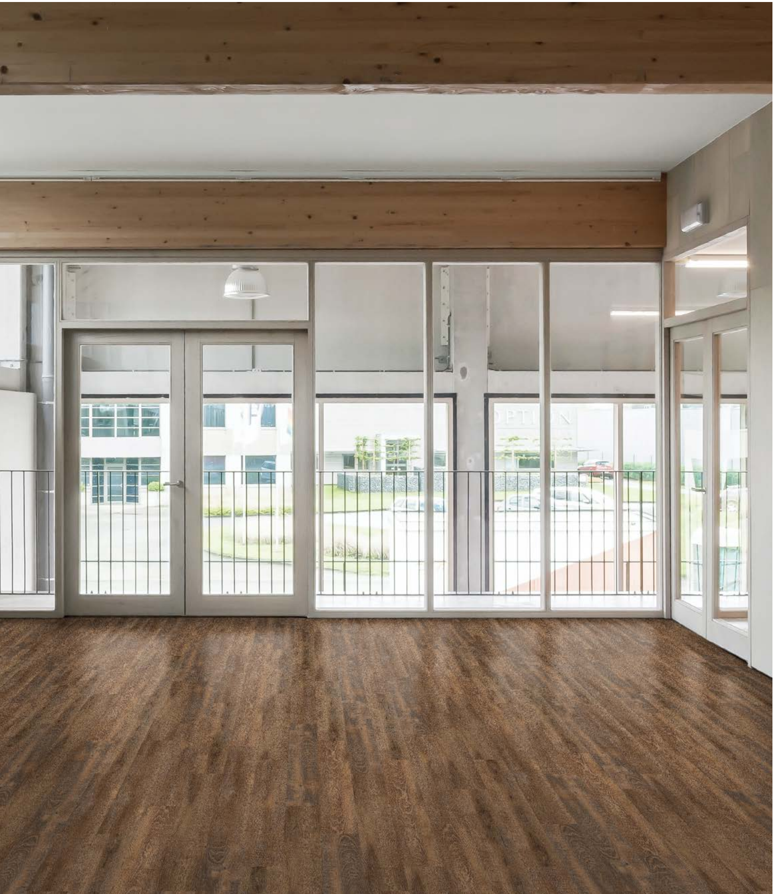
GROUND RULES BGRRUL, FIRST IN LINE 802018, 6 IN X 48 IN - RANDOM ASHLAR