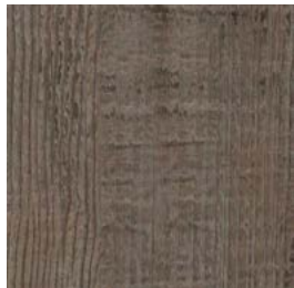
Mute Devices 802016