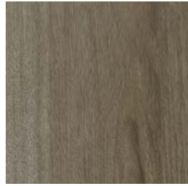
Come Prepared 802013