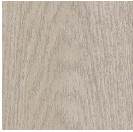
Fresh Start 802010