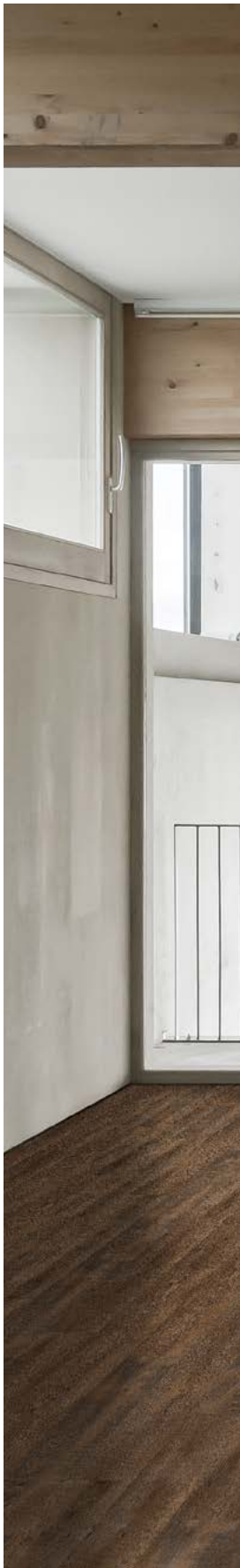
GROUND RULES BGRRUL, COFFEE FIRST 802012, 6 IN X 48 IN - RANDOM ASHLAR