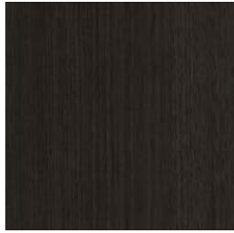
Coffee First 802012