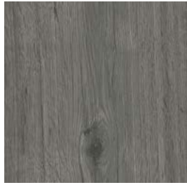
Manners Matter 802011