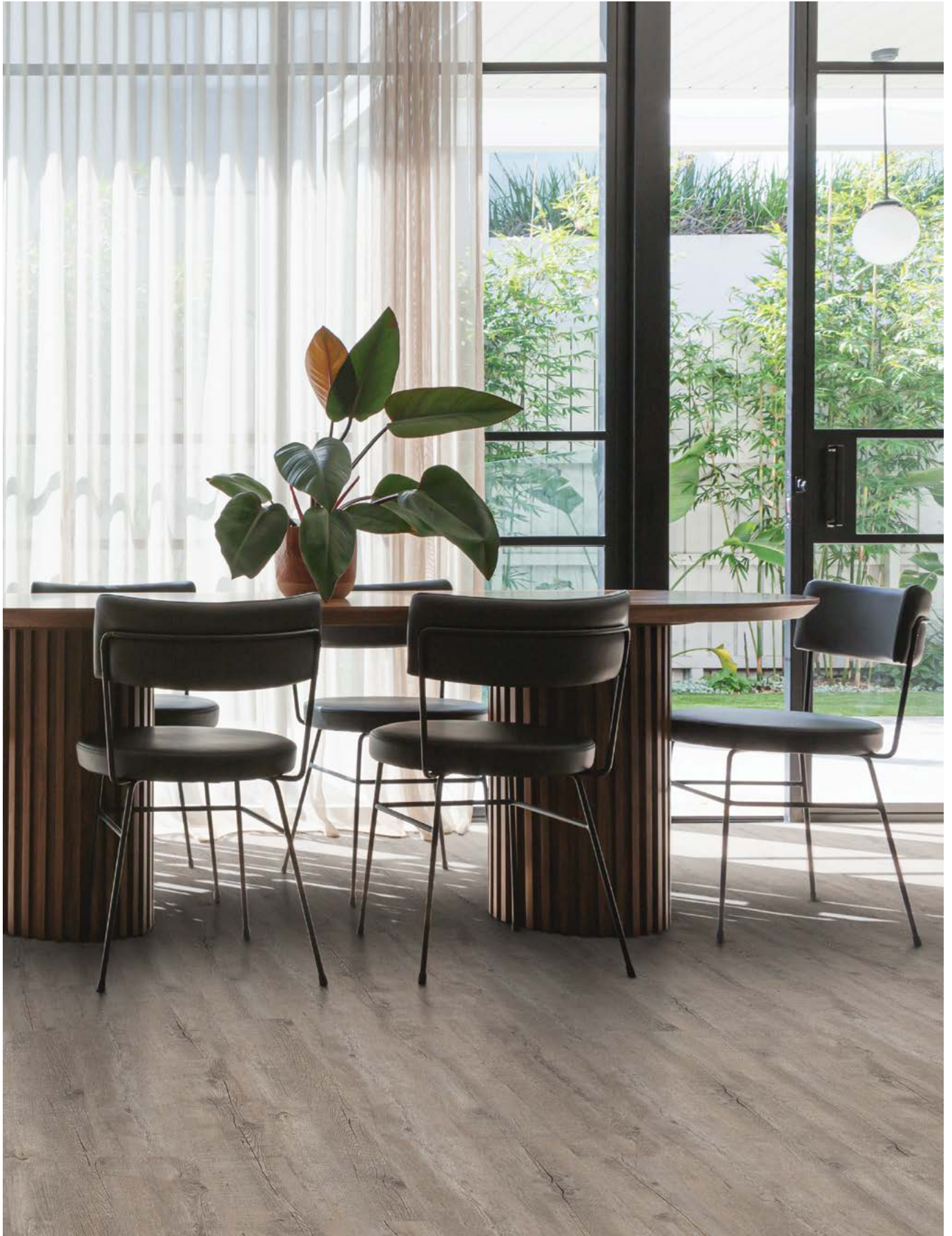
GROUND RULES BGRRUL, WASH YOUR HANDS 802014, 6 IN X 48 IN - RANDOM ASHLAR