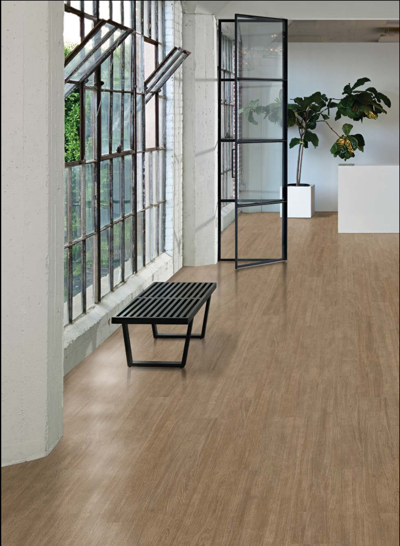
GROUND RULES BGRRUL, WAIT YOUR TURN 802015, 6 IN X 48 IN - RANDOM ASHLAR