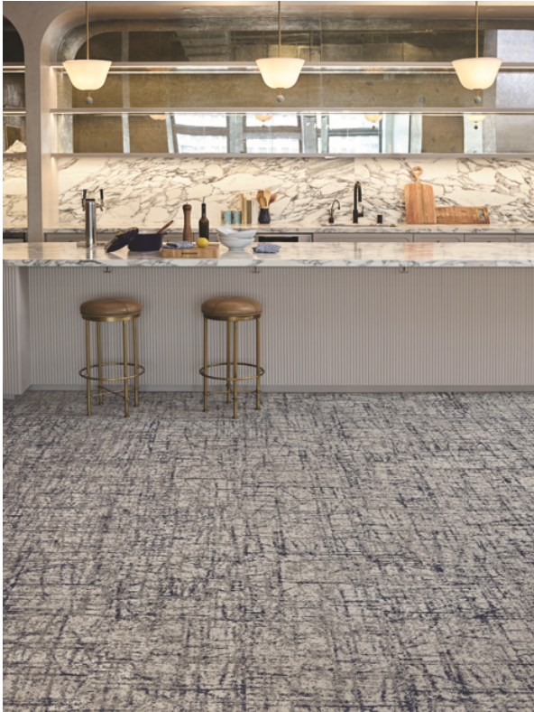
Culinary Collection, made with Thrive® (style shown: On the Block)

HIGH STANDARDS: BENTLEY REINFORCES COMMITMENT TO RESPONSIBLE MANUFACTURING Bentley Premium™ Nylon Now Exclusively in Thrive®, Universal Fibers' Solution Dyed, Type 6,6 Yarn