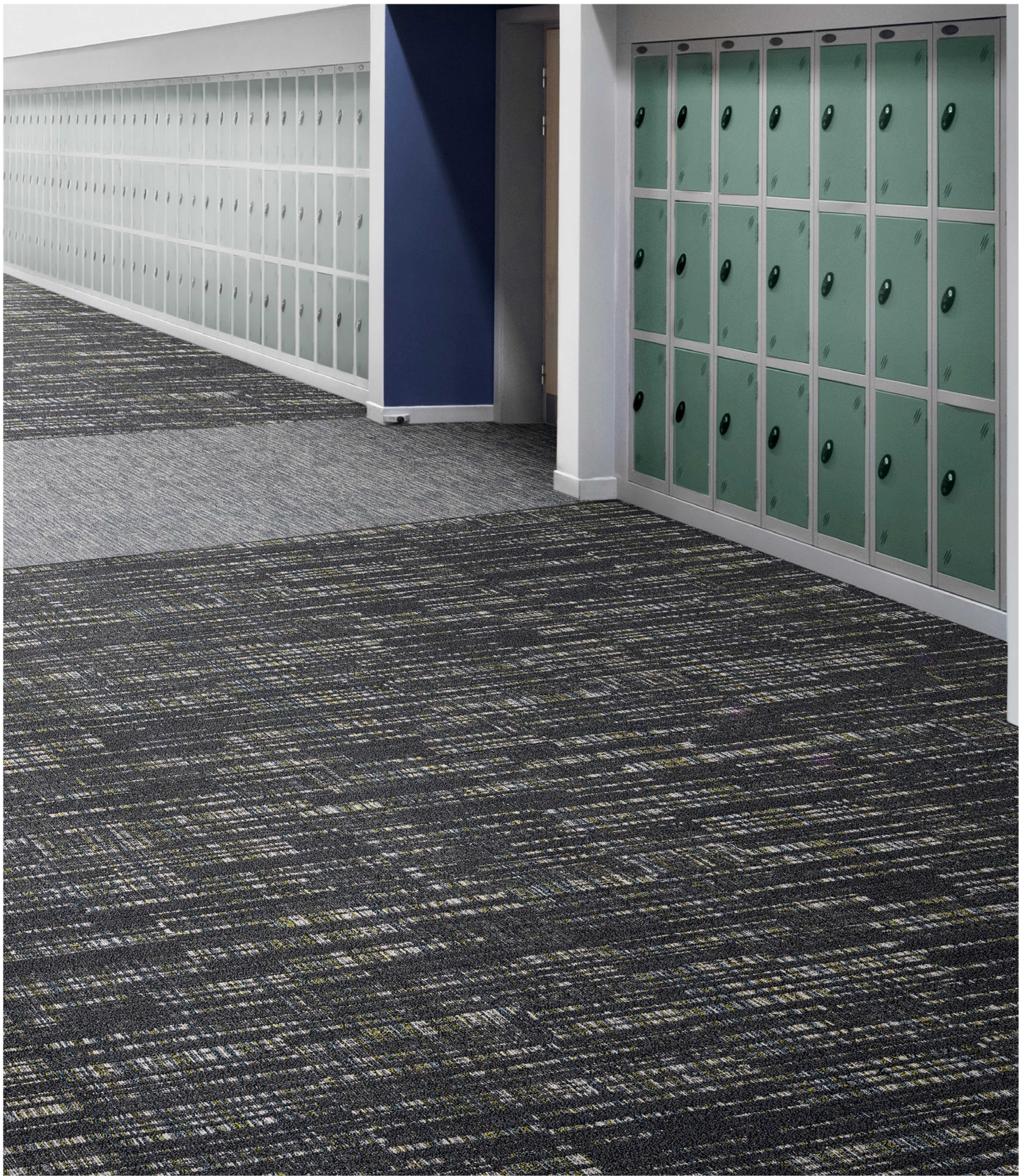
SUITABLE™ 4UVT4, APT 411460, ELITEFLEX 6 FT CUSHION MULTIPLAY™ II 6AMYT4, COOL DOWN 400057, ELITEFLEX 6 FT CUSHION